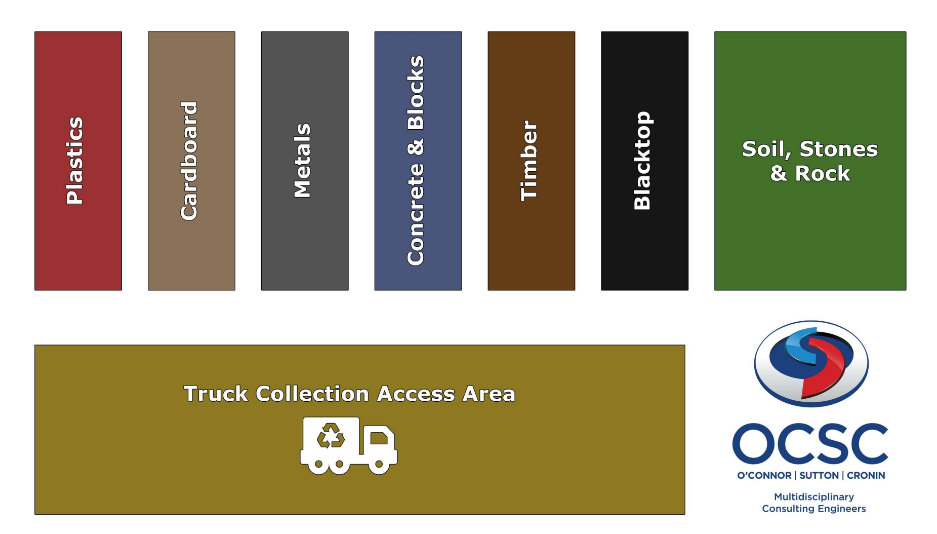
Figure 5: Proposed C&D Waste Storage Area (Scale: NTS)