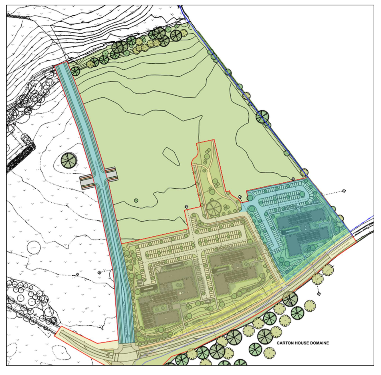
Figure 3: Development Phasing

Areas highlighted in yellow represent phase 1 of the planning application, while blue areas represent phase 2 of the planning application.