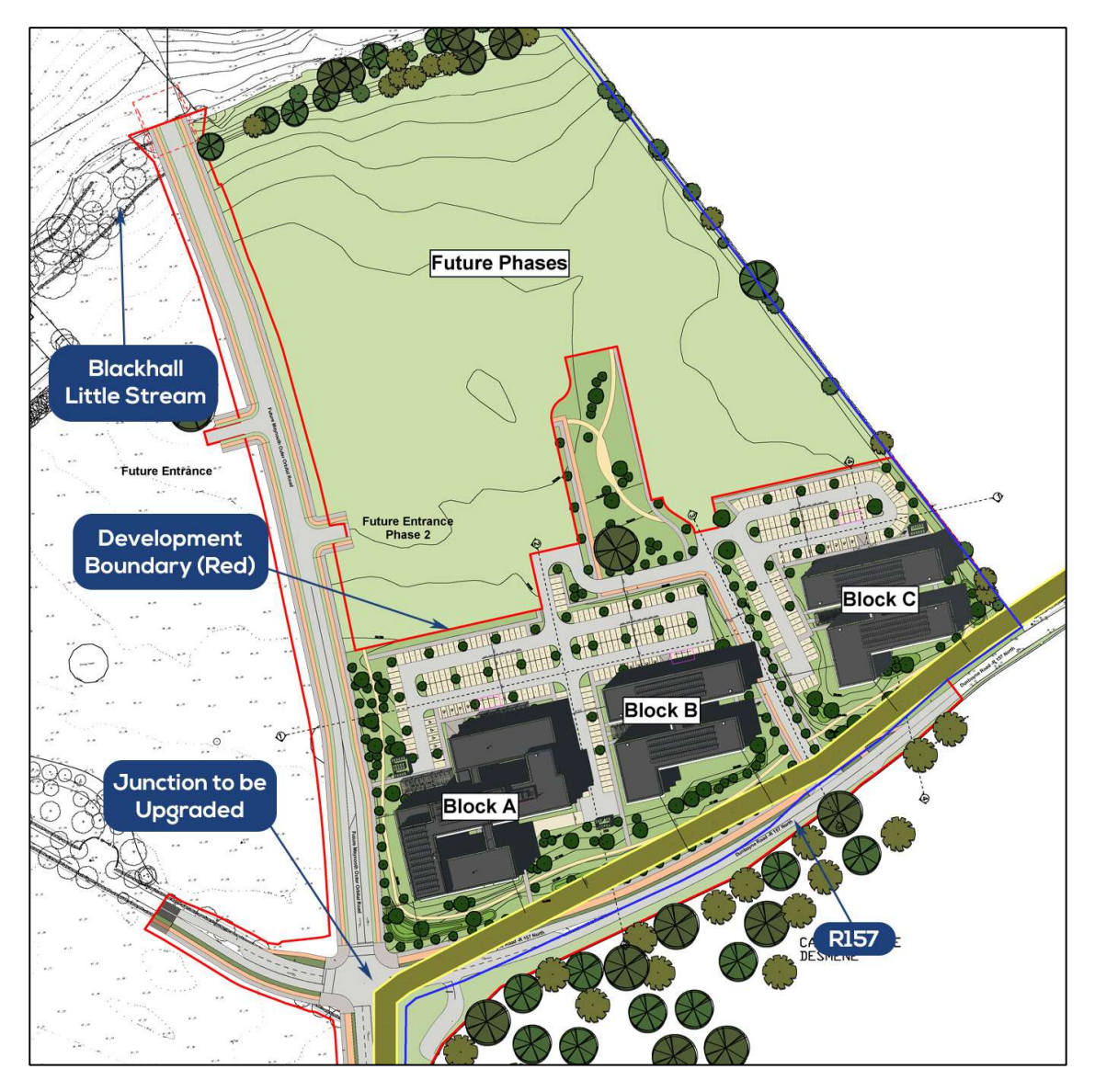
Figure 2: Proposed Development Layout

The proposed site layout is shown in Figure 2 below.